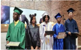
Pre-Kindergarten to Postgraduates

On Sunday, July 23, the Christian Education Committee presented the Graduating Class of 2023 to the Church.